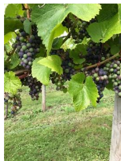
Pinot Noir grapes Whitecastle 2018